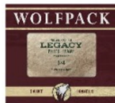
4x6 Photo Frames