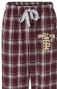
Flannel PJ Pants

Spread holiday cheer with a great item from the Spirit Store!