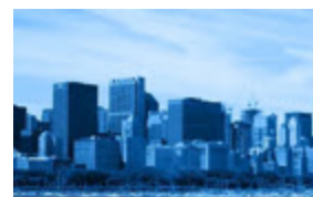
Chicago National College Fair

This college fair will be taking place on October 5 . Click HERE for more information.